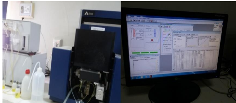
Fig b. Atomic Absorption Spectrophotometer (AAS)

All poultry feed samples were prepared by the method of wet-acid digestion [11]. Firstly, all the samples of poultry feed were made uniform separately. A known quantity, 2 grams of each sample was placed into the digestion flask, 10ml of HNO 3 (65%) pure was added and mixed well and similarly, 4ml of H 2 O 2 (30%) was added. After mixing of solution, the mixture was kept in Fume Hood. The mixture of the solution was firstly heated on a hotplate at 250 0 C, then increasing the temperature slowly to about 300 0 C for 15 minutes, after the appearance of white fumes, digested samples were cool down. The samples were filtered using a Whatman filter paper No.14 then dissolved, in 20ml distilled water and again filtered. The filtrates were poured individually into 50ml pre-washed bottles and then analyzed on a Double Beam Atomic Absorption Spectrophotometer (AAS) Aurora A11200.