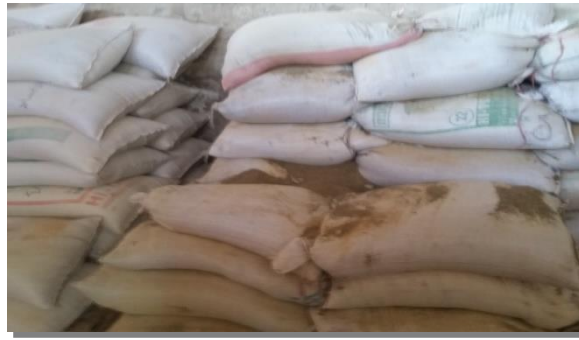
Fig a. Collection of Poultry Feed at Poultry Farms of City, Hyderabad

metals. Determination of heavy metals: The concentration of heavy metals; lead (Pb) and chromium (Cr) in poultry feed samples were determined to apply the standard procedure and using a double beam Atomic Absorption Spectrophotometer (AAS) Aurora A11200 instrument (Fig.b).